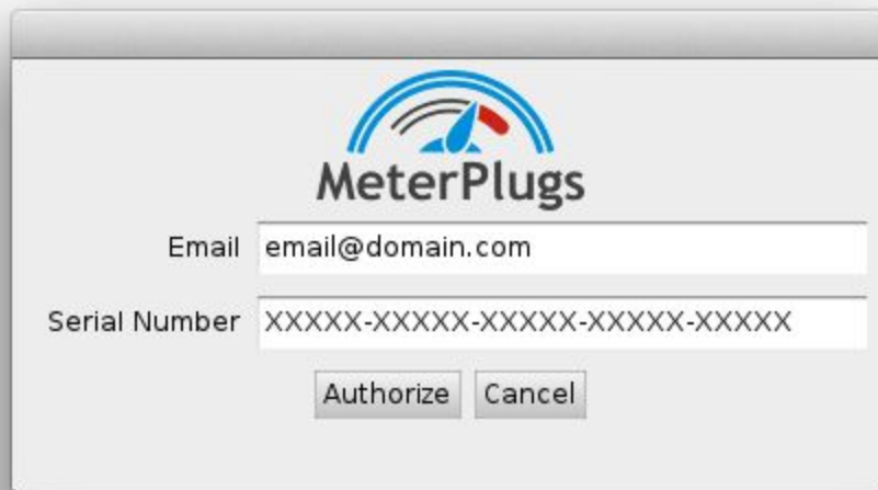
Figure 1: Perception Authorization

When you first install and run Perception, an authorization dialog will prompt you for your email address and serial number. Enter the email address that you used when you purchased Perception. Note that both fields are case-sensitive.